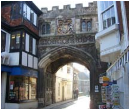
Above: The first glimpses of the Cathedral Close, it's one of the best things about Salisbury

The co-owner of The Salisbury Chocolate Bar & Patisserie talks loves, loathes and the joys of chocolate